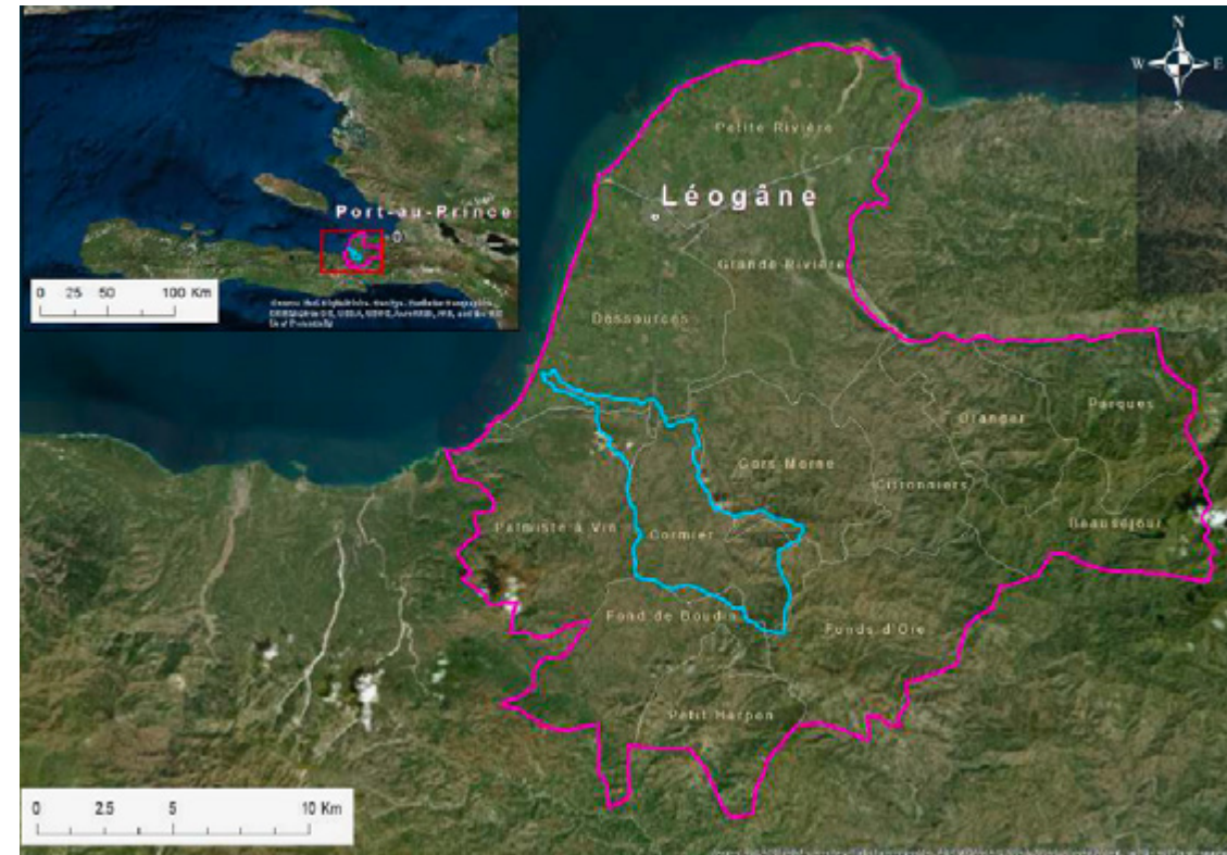
Figure 1. Map of the Cormier Watershed (outlined in blue) and location within Haiti.

Together, the Haiti Reforestation Partnership (HRP) and the Comprehensive Development Program (CODEP), have worked to implement reforestation over the past 32 years in the Cormier Watershed and adjacent areas in Léogâne County in Southern Haiti (Figure 1). The port town of Léogâne is about 30 km west of Port-au-Prince. Steep topography, population pressure, and lack of access to mechanization in the Cormier Watershed has forced land users to cultivate land on steep slopes and to plow the soil by hand. The catchment extends over 30.4 km 2 (Eichenberger, 2019; Figure 1).