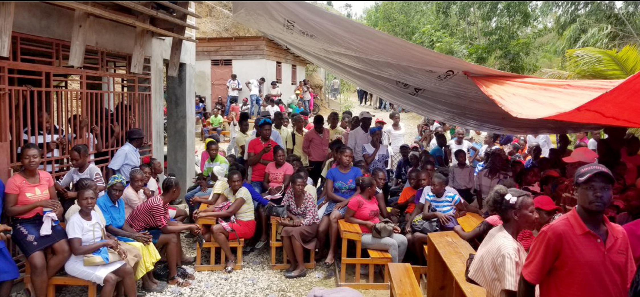
Figure 13. The CODEP community celebrating the 30th anniversary of HRP and CODEP in 2018.