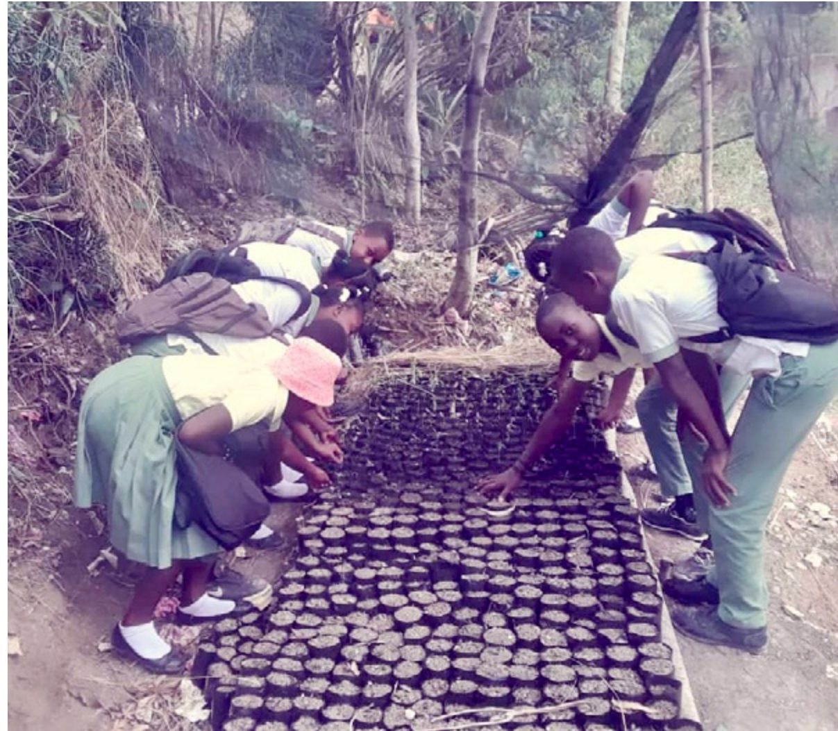
Figure 9. CODEP school students select seedlings to plant in their home gardens on Agriculture Day.

In 2021, HRP established a mentoring program with a charter cohort of nine young people who have graduated from the CODEP school (Figure 10). The program includes building nurseries, learning about the challenges of mapping, and becoming acquainted with CODEP’s history, methodology, and challenges. The two-year program provides hands-on experience working and learning with chèf ekips and Animators. Each student receives a monthly stipend and transportation expenses and obtains a certification upon completion of the program. One graduate of the program is receiving