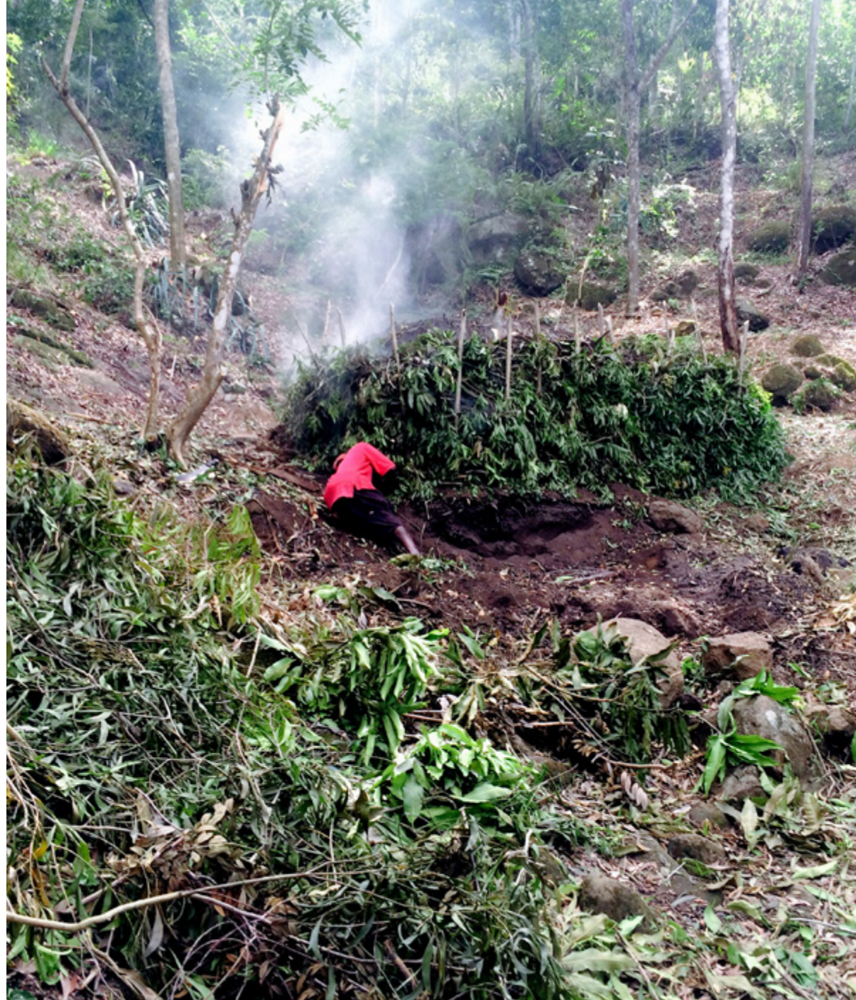
Figure 2. A CODEP worker producing charcoal.

Studies of changes in forest cover in Haiti since 2000 have used a variety of methods, with conflicting results. Based on random sampling of aerial photographs, Rodrigues-Eklund et al. (2021) found a dramatic increase in estimated tree cover from 14.3% in 2002 to 19.3% in 2010.