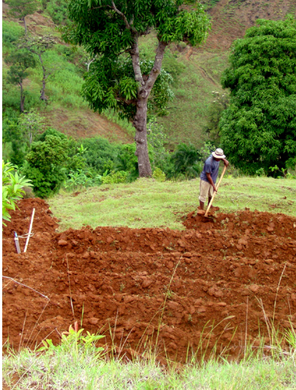
Figure 5. CODEP worker planting contour hedgerows with vetiver grass to hold the soil in the Cormier Watershed.

Another principle of the CODEP method is that trees are to be harvested only under strict rules and under the supervision of Animators. As stated by Michael Anello, Executive Director of HRP, “It’s a working forest, not a preservation forest. There’s a big difference. For each tree that is harvested, 4–5 trees are planted in the immediate vicinity.”