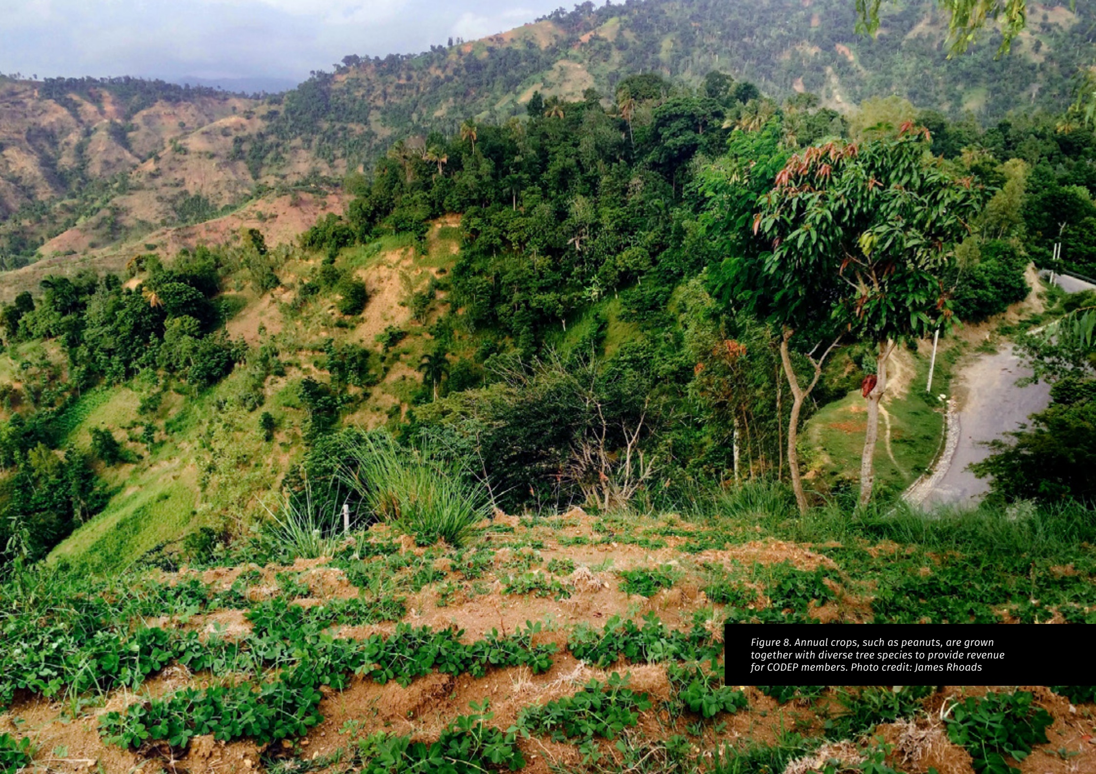
Figure 8. Annual crops, such as peanuts, are grown together with diverse tree species to provide revenue for CODEP members.