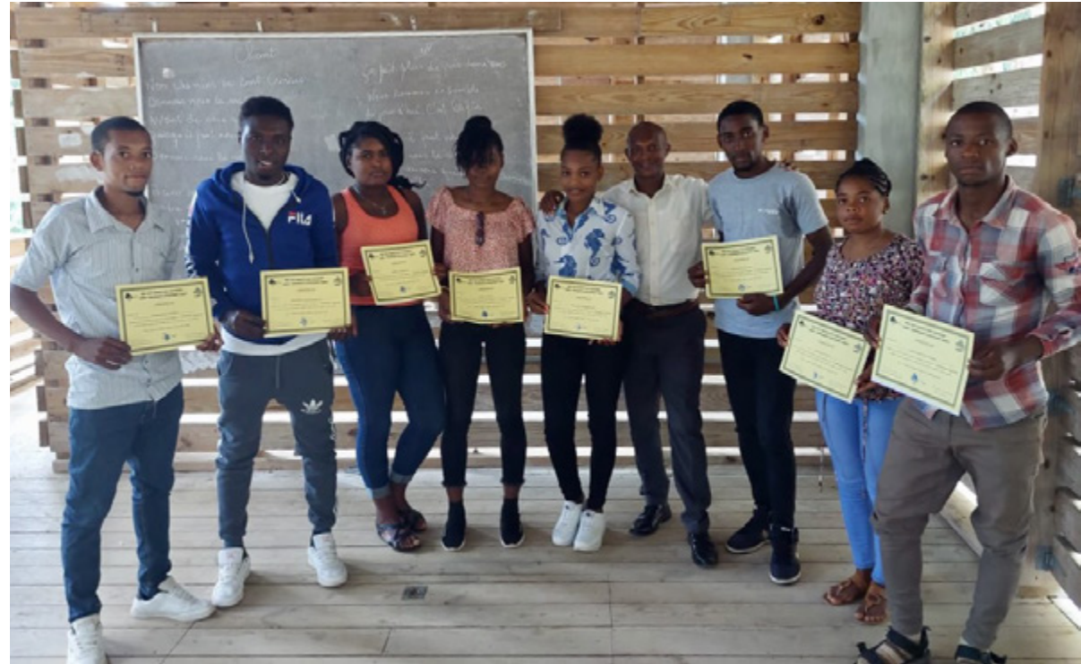
Figure 10. Mentorship program graduates proudly display their diplomas. They are future Animators in training.

continuing education support to attend college to study agroforestry (Haiti Reforestation Partnership, 2022b). Over time, HRP reduced funding for CODEP activities such as the school and the entrepreneurial activities and focused on supporting only the reforestation and mentoring activities. CODEP has since become more a self-sustainable enterprise.