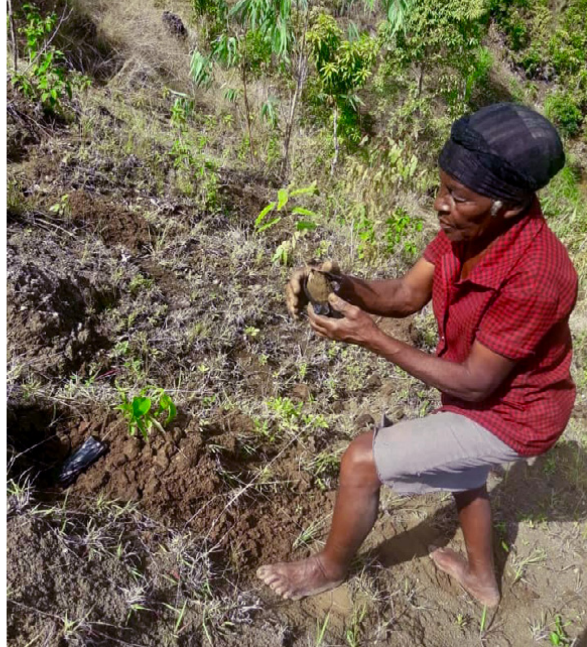
Figure 4. CODEP workers plant twice a year during the rainy season.