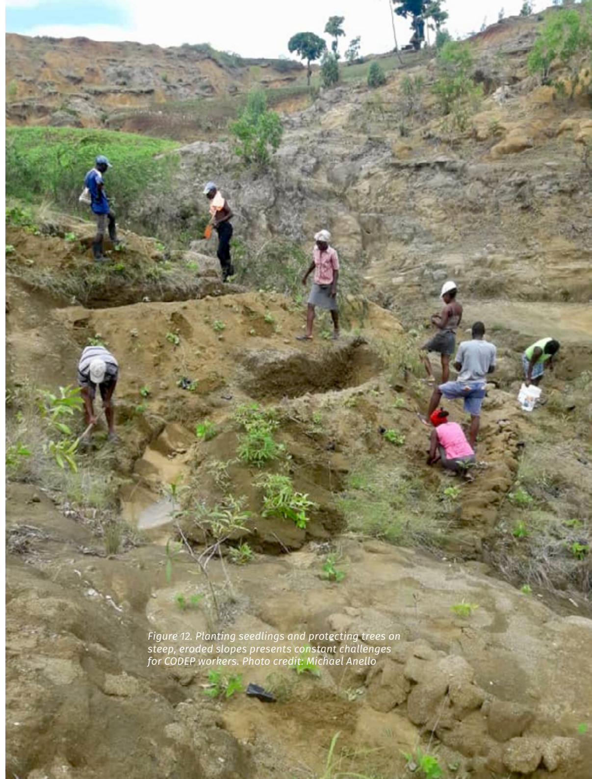
Figure 12. Planting seedlings and protecting trees on steep, eroded slopes presents constant challenges for CODEP workers.

Periods of political violence reduced the ability to host visitors, volunteers, and interns and to develop a collaborative research program with foreign and resident scientists. Limitations of formal land tenure and ownership make it difficult to secure areas for reforestation, expand the scope of reforestation activities, and ensure their long-term persistence. Persistent language and cultural barriers arose between the U.S. leaders of HRP and the Haitian leaders of CODEP; few U.S. leaders spoke Haitian Kreyol. Moreover, CODEP leaders lacked trust with other Haitians. These barriers restricted the upscaling of reforestation and community development interventions, as local constraints on resources (land, human capacity, and financial support) were key limiting factors.