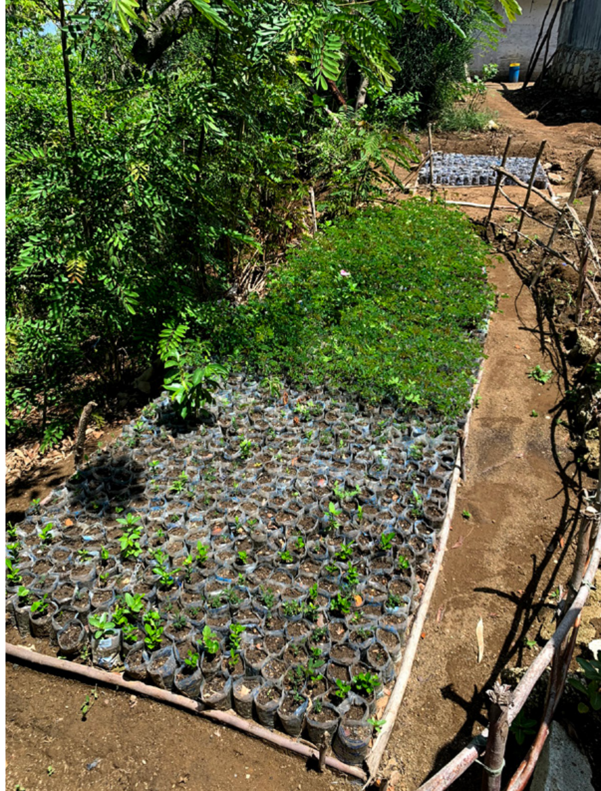
Figure 7. One of many CODEP backyard nurseries, locally called pepinyè.