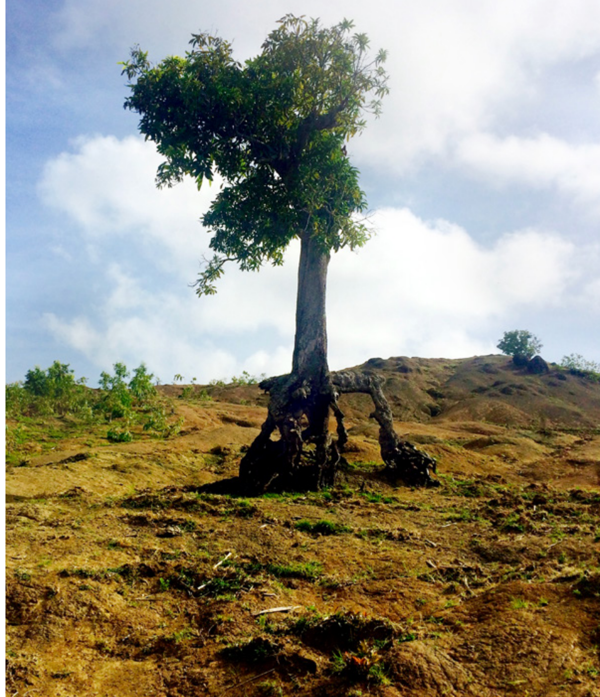
Figure 3. An isolated mango tree grows on heavily eroded soils. To the left are Eucalyptus saplings planted by CODEP.

It took a group of missionaries from the Presbyterian Church USA to establish the fundamental linkage between reforestation and addressing the basic needs of rural communities. Through initial connections with Hôpital Ste. Croix, an Episcopal missionary hospital in Léogâne, the Haiti Fund was initiated to tackle malnutrition and disease by adopting a holistic approach to address unresolved chronic diseases and environmental degradation in the Cormier Watershed.