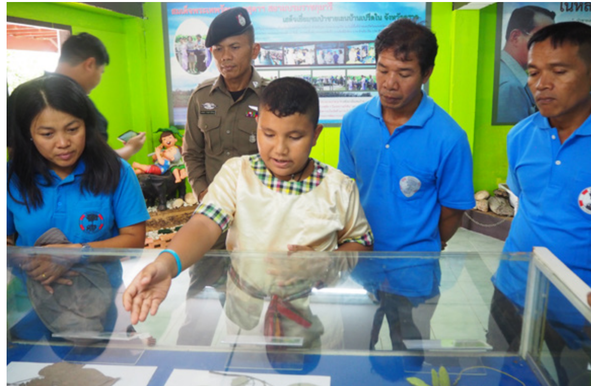
Figure 9. A young member of Pred Nai shows visitors botanical collections in the Community Learning Center in 2018.

Sharing knowledge and experience related to community-based forest management was important in the development of the Trat Provincial Forestry Network and the Community Coastal Resource Management Network of Trat Province, a network operating at the provincial level and focusing on communities on the coast of the Gulf of