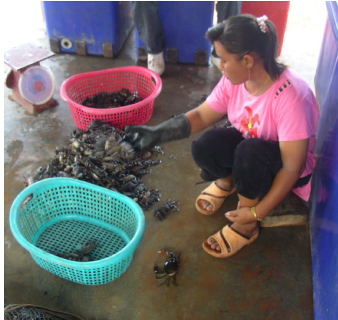
Figure 2. A village woman sorting Grapsid crabs.

Today, a major source of livelihoods in the village is fish and shrimp farming and crab