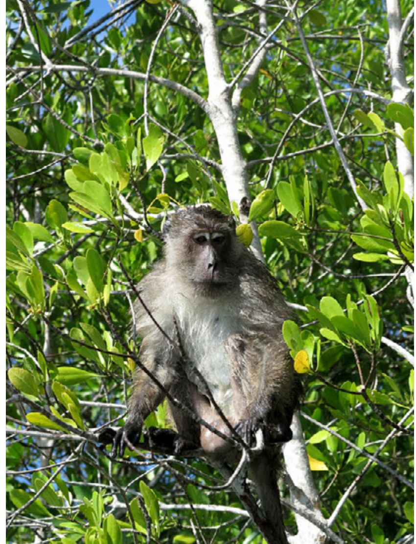
Figure 10. (Left) The Painted stork ( Mycteria leucocephala ) and (Above) Crab eating macaque ( Macaca fascicularis ) are some of the native wildlife that have returned to the Pred Nai mangrove ecosystem.