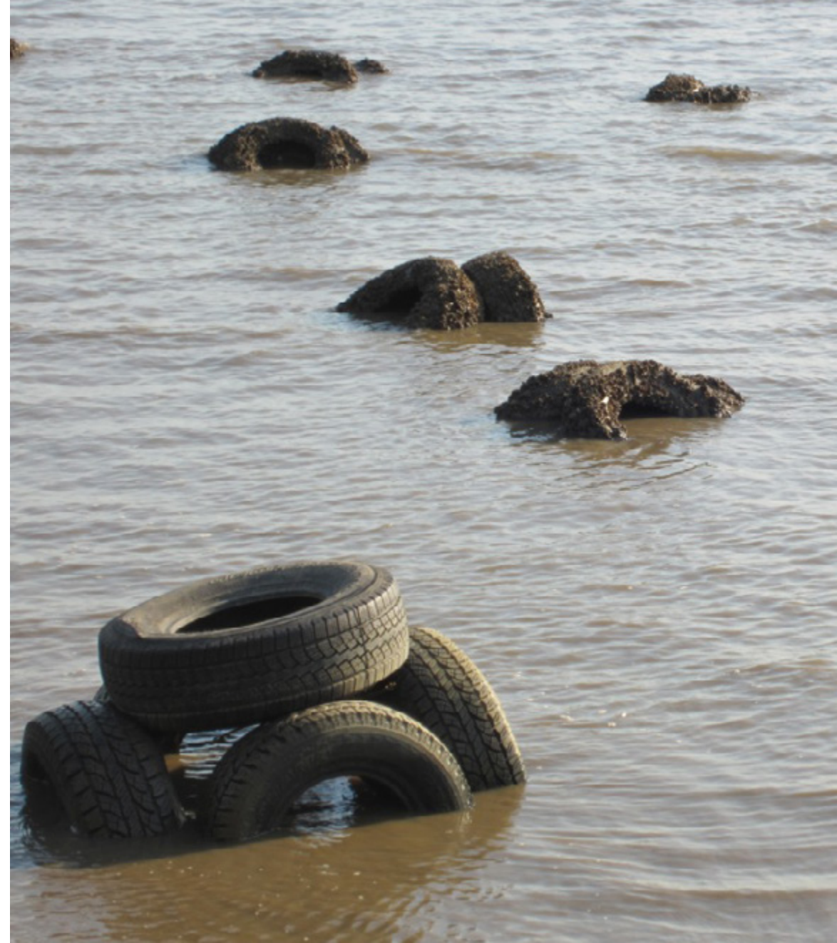
Figure 5. Fish houses constructed of rubber tires.

Principles for mangrove forest ecosystem restoration were adopted that reflect the broad socio-environmental goals of the Pred Nai villagers (Box 1). Throughout the