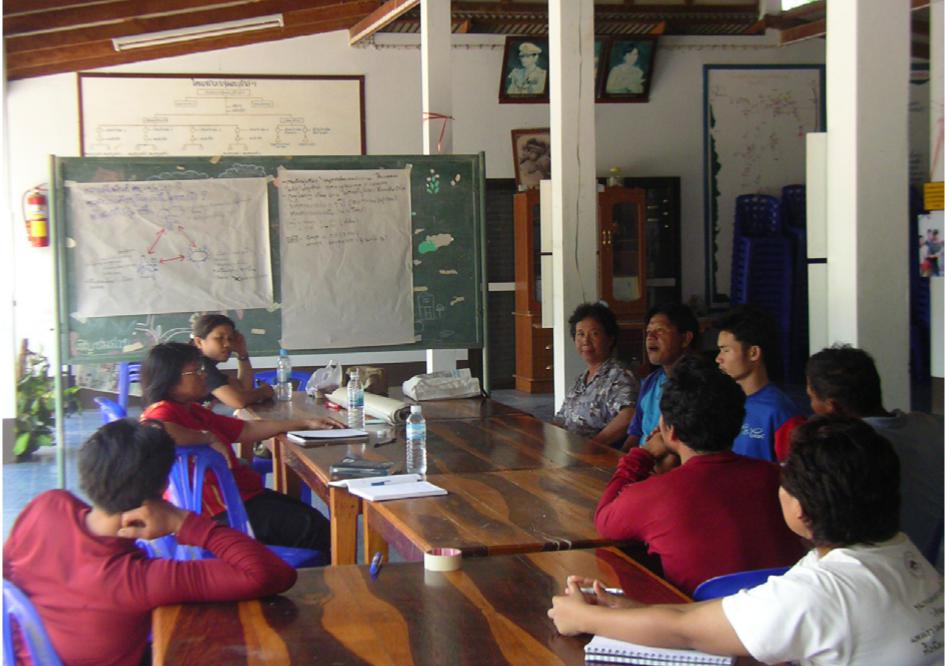
Figure 7. Committee meeting of the Pred Nai Community Forest Group in 2005.