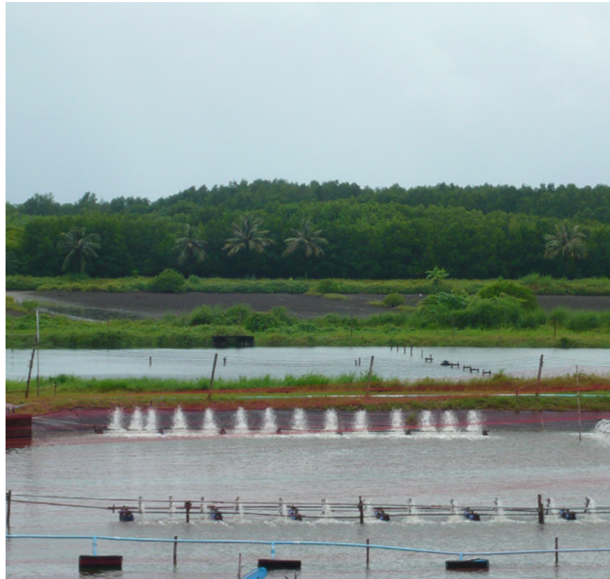
Figure 3. Shrimp aquaculture in Trat Province, Thailand.

(On-Prom, 2014) and has been managed by the RFD as a reserve forest with some small-scale commercial logging carried out over many years (Senyk, 2006). But in the mid-1980s corporations intensified their harvest of trees from the mangroves and began constructing shrimp aquaculture ponds following logging (Senyk, 2005). Uncontrolled logging and intensive shrimp farming caused heavy destruction (Figure 3). As a result, the area of mangroves was reduced from its original extent of 48,000 ha to 1,920 ha by the early 1980s (Silori et al., 2009). According to interview sources, the extractive operations by Thai national corporations were conducted in clear violation of government regulations that required replanting in logged areas (Senyk, 2005). Government agencies were unwilling or unable to stop these illegal activities (Senyk, 2006). Moreover, extractive industries run by outside commercial interests provided little economic benefit for local people and negatively impacted mangrove resources needed for their subsistence and livelihoods (Senyk, 2005).