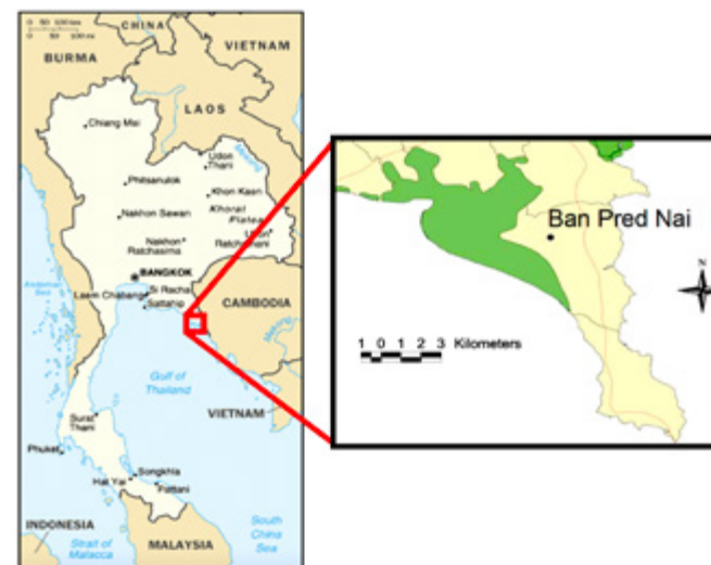
Figure 1. Map of Thailand, Ban Pred Nai and community mangrove forests (in green).

The village of Pred Nai is located in Muang district of Trat Province on the eastern seaboard of Thailand, close to the Cambodian border (Figure 1). The region has a tropical climate typical of Thailand: hot and humid with a monsoon season typically lasting from May to October (Senyk, 2005). Pred Nai Village was founded in the 1850s by less than 10 households. By 2009 the village population was reported to be 560 people from nearly 130 households (On-Prom, 2014). The geographical area of the village is 378.7 ha, of which nearly 42% is residential, while the remaining area is under agriculture and other land-use practices (On-Prom, 2014).