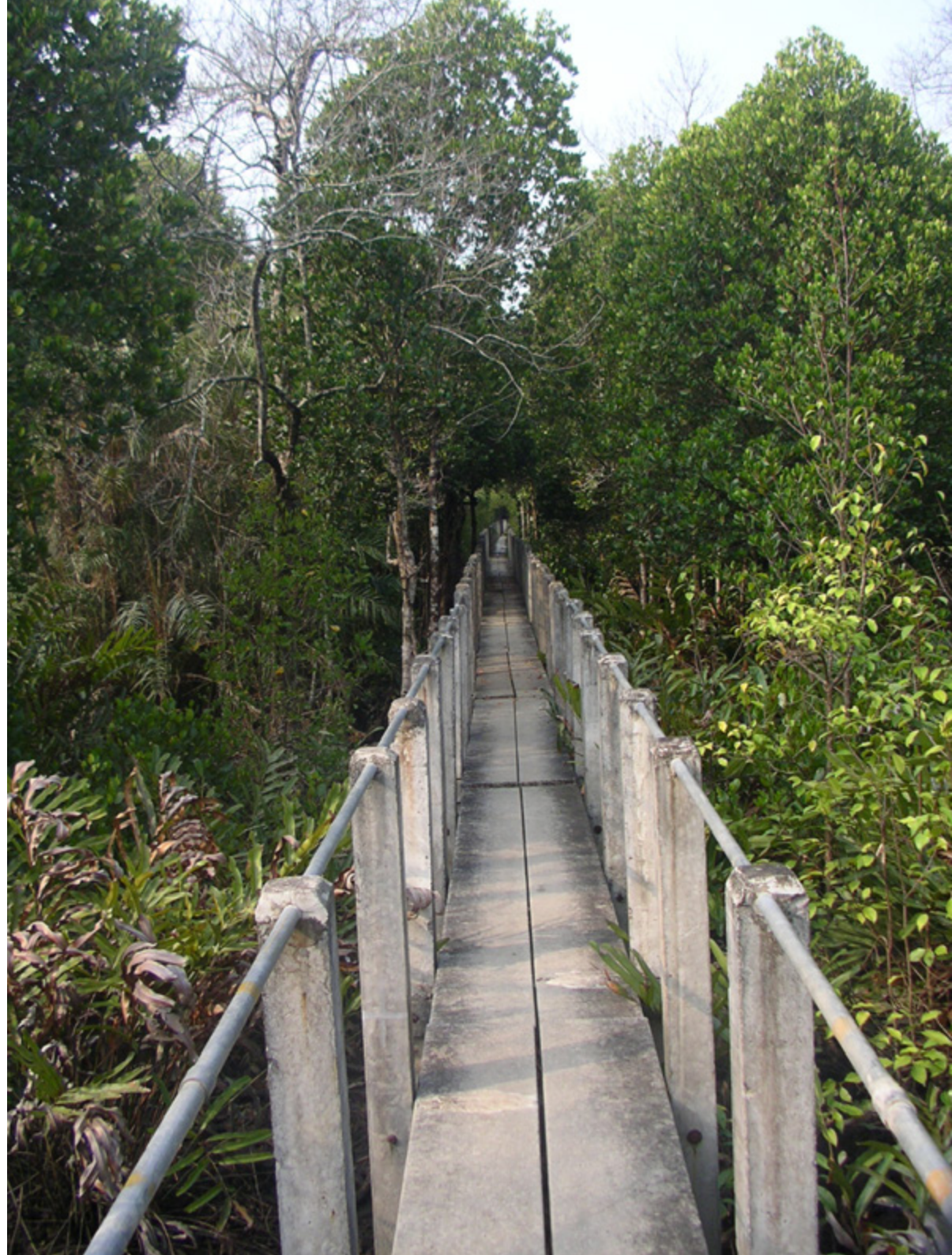
Figure 4. Walkway through the mangroves.

particularly, the Grapsid and Mud crabs, which are key cash earning species for villagers (Soontornwong, 2006; Silori et al., 2009). The Thailand Research Fund (TRF), a national government agency responsible for providing funding for research in Thailand, began working with Pred Nai in 2003. The TRF provided funding to PNCFG to conduct research into coastal erosion occurring in the mangroves as a result of boats fishing within three kilometers of the shoreline. As part of their assistance the TRF also provided some funding for the construction of “fish houses” (Figure 5) out of used rubber tires which are used offshore to reduce erosion and provide alternative fish habitat (Senyk, 2006). Villagers and outsiders said these structures reduce the time needed for fish harvesting (Kaewmahanin et al., 2007).