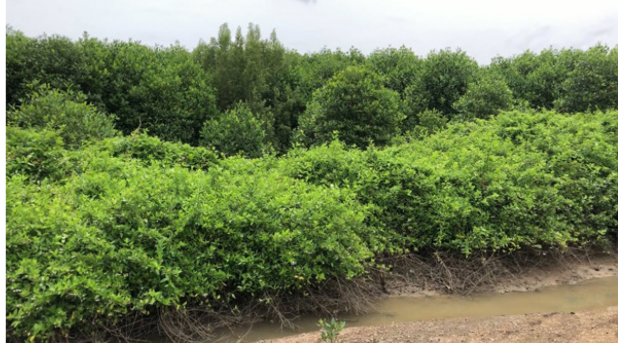
Figure 8. Mangrove reforestation site in Pred Nai in 2011 (top) and 2018 (bottom).