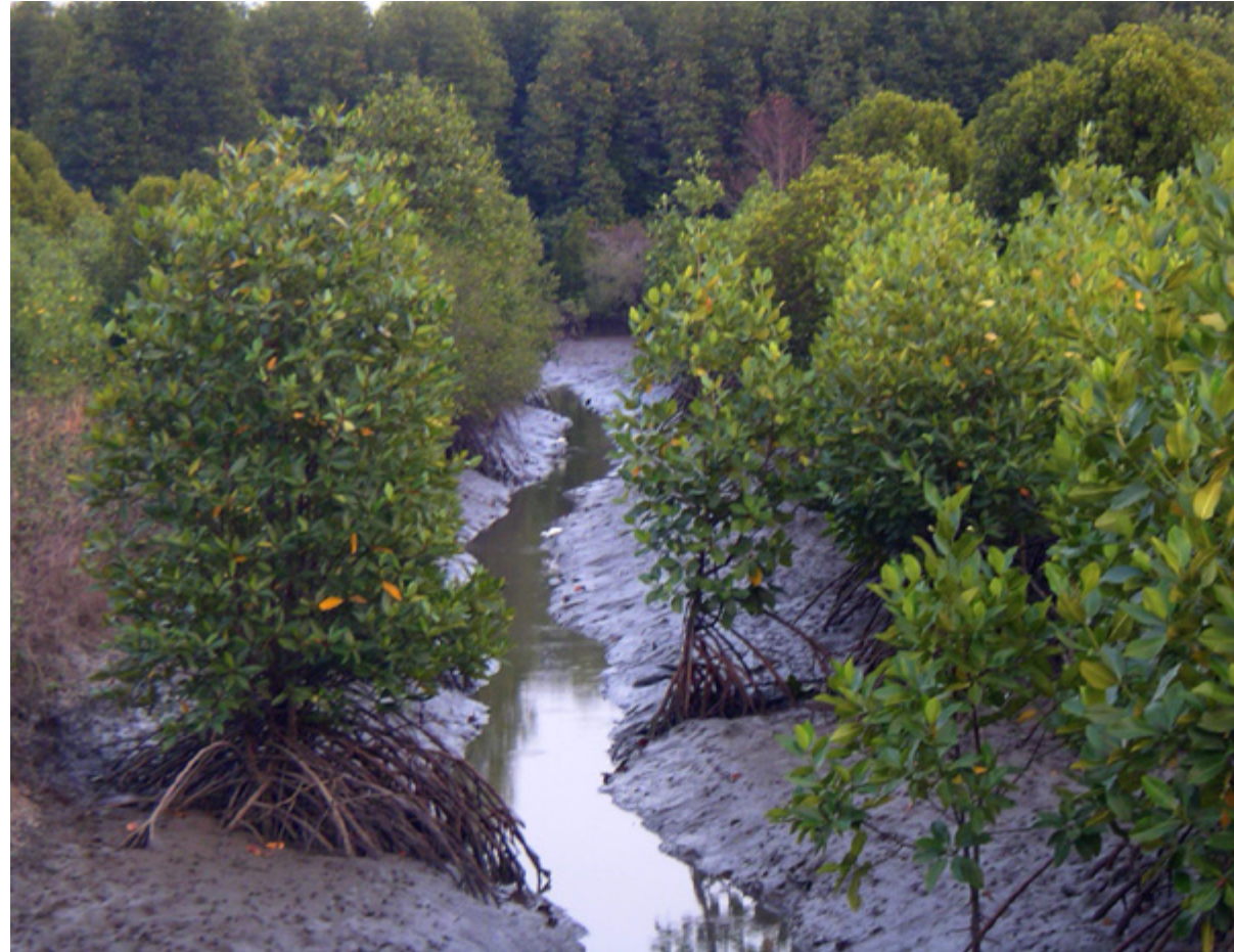
Figure 6. Young mangrove trees regenerating along a canal.

Since its formal inception in 1988, PNCFG (Figure 7) showed a great interest in technical and academic support and training, and