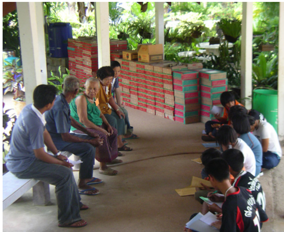
Figure 12. Village elders meeting with children.

small mesh size in the river which forms the boundary with Pred Nai's section. These actions violated rules of the conservation group forbidding the catching of small fish, upsetting Pred Nai villagers (Senyk, 2006). Initially, the customary uses of mangrove resources by Pred Nai village were not recognized by governmental authorities. In the late 1990s, the RFD granted usufruct rights to the Pred Nai community, which can manage and use the resources. All forests of Thailand remain under state ownership; restrictive and intrusive national legislation can potentially usurp the rights and efforts of the local villagers in the name of the national interest (Kaewmahanin et al., 2008). Gains in local empowerment and community-based management could easily be lost. Finally, a challenge facing Pred Nai as well as many other community-led initiatives is how to sustain engagement with future generations. Youth are critical assets to the reforestation project and overall community functioning (Figure 12). As one PNCMG member stated, "The future of these forests depends on our children." Out-migration of youth to urban areas and lack of involvement in village activities threaten continuity of leadership and community cohesion in the long term in Pred Nai and other villages within Trat Province (RECOFTC, 2012).