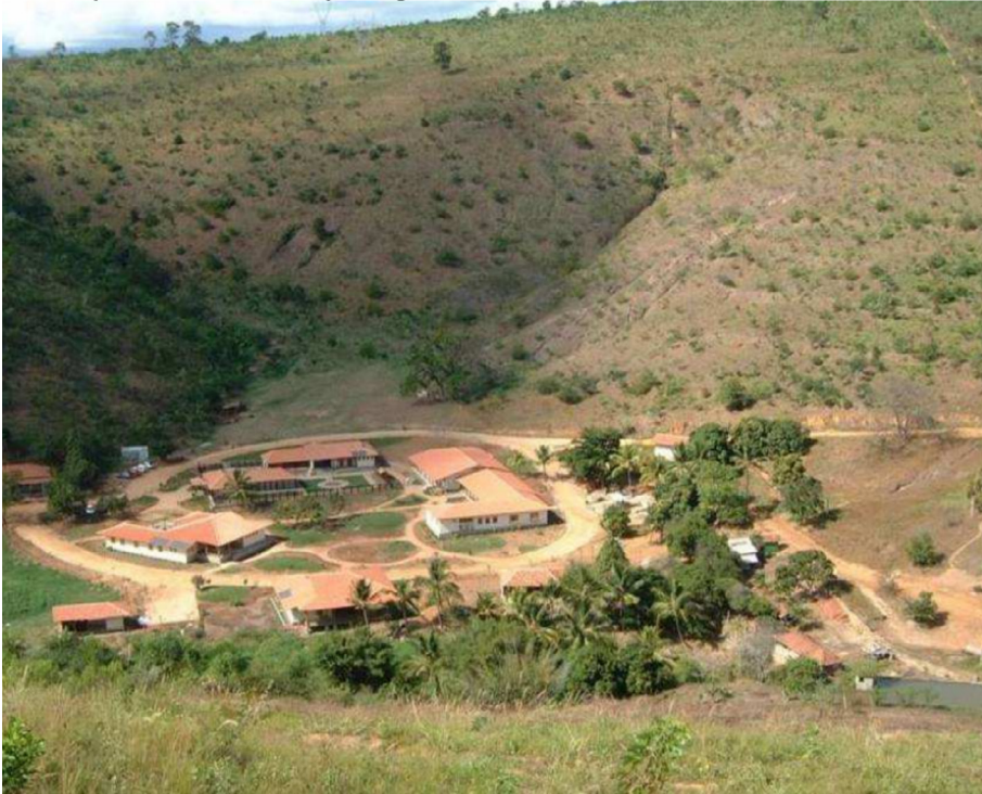
Figure 1. Instituto Terra and Fazenda Bulcão in 2002.

Since the 1980s, the couple was alarmed by the speed of the forest degradation, not only on the farm, but across the entire Rio Doce Watershed. In 1990, upon inheriting the property, they decided to realize their dream of “making the Atlantic Forest born again, the way it was 50 years ago.”