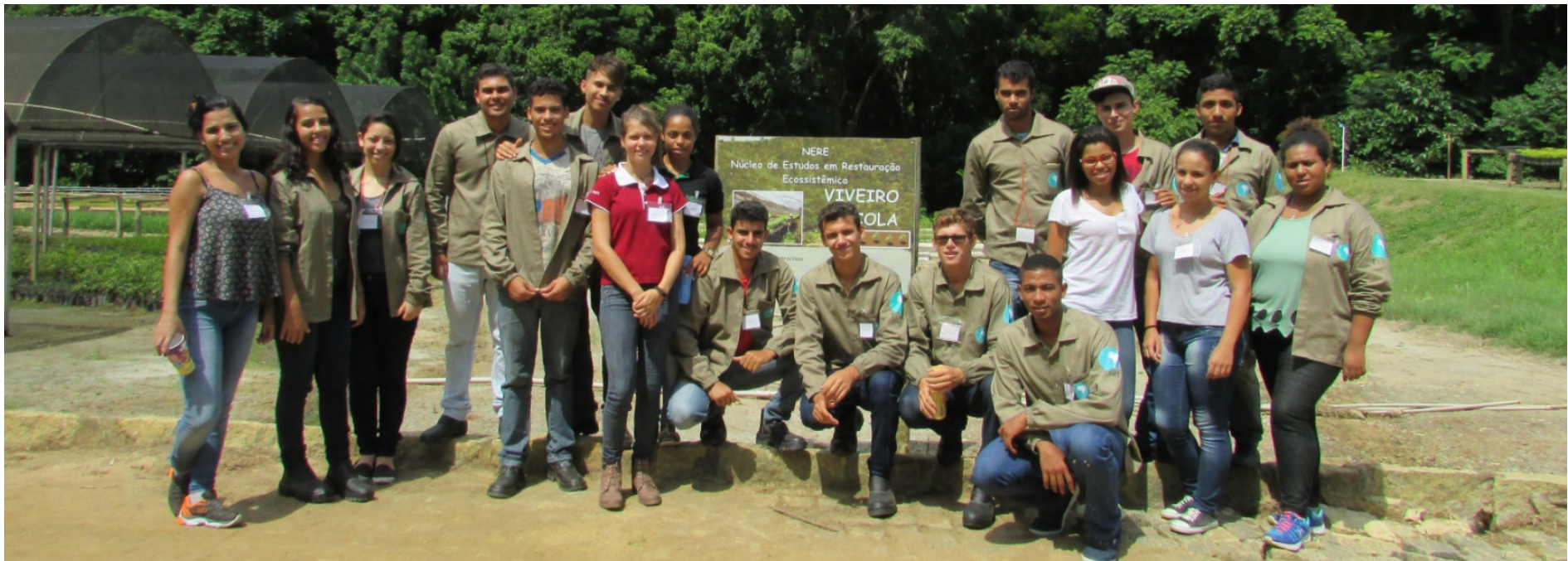
Figure 6. Students from the NERE program in 2017. They are the future makers of change.