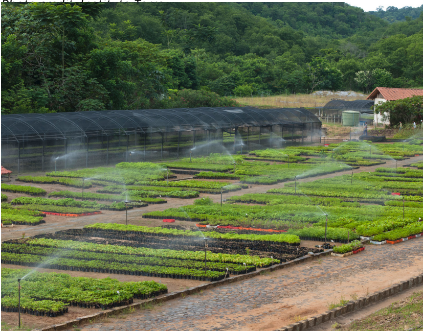
Figure 3. The nursery at Instituto Terra.

In 2001, the Instituto Terra received support from the NGO SOS Mata Atlântica and from Conservation International to build the infrastructure for a native seedling nursery (Figure 3). The nursery initially produced 80,000 seedlings in a year. After two expansions, the nursery now has the capacity to produce over 1 million seedlings a year. The staff collects seeds for the nursery from trees in a radius of 200 km around Fazenda Bulcão. In 2018, a seed bank program was initiated that focused on the most threatened tree species in the region. During seed collecting expeditions in 2018, 110 mother trees of native species were registered including 40 genetic sources of Peroba amarela ( Paratecoma peroba ), an endangered species from the region.