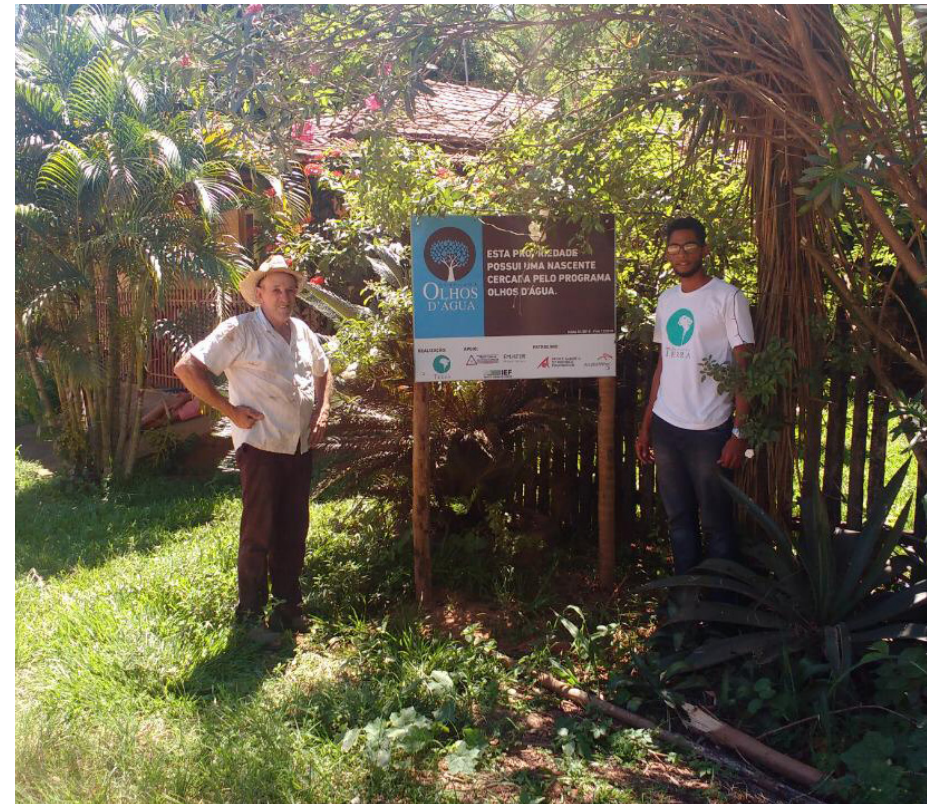
Figure 4. Working with rural producers to restore springs

The Semear Portal was created to support restoration practitioners with online information on native species production and maintenance. It shares knowledge on production of native tree seedlings gathered by the nursery staff. The Semear Portal also provides an open space dedicated to other institutions, universities, nurseries, laboratories and scholars who want to share other methodologies and processes.