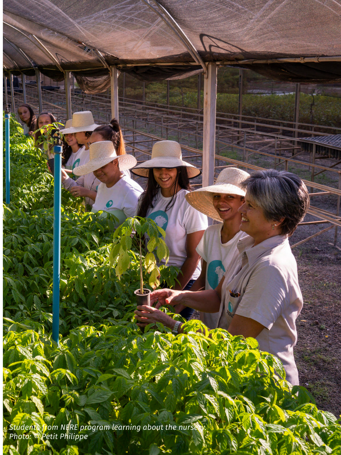
Students from NERE program learning about the nursery.

farmers who implement restoration. Planting seedlings is only a small part of the process. Crisis often generates the impetus for change. Such was the case after the tragic Mariana Dam accident in 2015. Funds were generated from private companies, government, and donors to restore the Rio Doce Watershed. The Instituto Terra was there, ready to provide the experience and capacity to work in the region. They were the first organization to sign a partnership contract with the Renova Foundation to restore 500 water springs in the region.