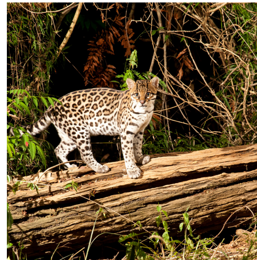
Figure 5. An ocelot or jaguatirica ( Leopardus pardalis ) on Fazenda Bulcão ©Leonardo Merçon. Photo courtesy of Instituto Terra.

From 2010 to 2018, the Olhos D'Água Program protected 1,960 springs, initiated restoration of 1,313 ha, and involved 1,049 rural families. The Program was selected by the UN-Water Commission in 2011 as one of the best programs for the recovery and protection of water springs. A partnership with Energest and the EDP Institution allowed