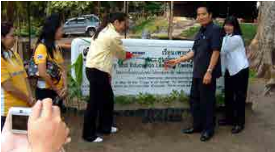
Figure 3. Officials from WWF, King Power, and the sub-district administration opening the new nursery at Ban Mae Sa, 2007.

A hugely important outcome of the project was an evidence-based set of techniques for restoring tropical EGF on abandoned agricultural fields. Only 8 years after planting 29 framework species in 4 ha, more than 70 non-planted tree species recolonized naturally, herbaceous weeds were eliminated, humus had accumulated, a multi-level canopy had developed, and biodiversity recovery was underway (Sinhaseni, 2008). The project demonstrated the effectiveness of the FSM in harnessing natural regeneration mechanisms to restore EGF on moderately degraded sites and it generated a set of generic protocols to develop similar restoration practices for other tropical forest countries.