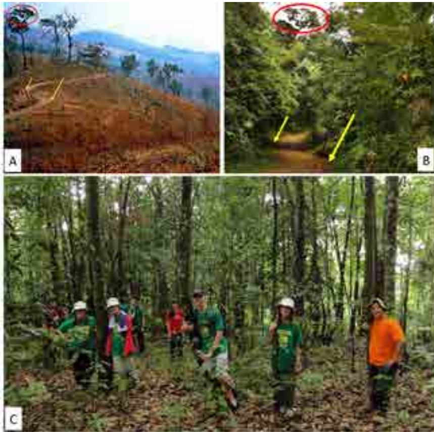
Figure 4. A. Upper Mae Sa Valley, May 1998 before restoration; B. same site, left of the track, restored forest 15 years old, planted 2001; right, 9 years old restored forest, planted 2007 (photo September 2016). C. Inside the restored forest (10 years old), a dense understory develops beneath the canopy of the planted trees, with up to 70 recruit tree species represented by seedlings and saplings in the ground layer.

Conversion of forest to agriculture was restricted within the national park. FORRU-CMU invested heavily in annual fire protection and sponsored cutting of fire breaks around the village. They paid for eight people to watch for fires during the dry season and the whole village contributed to fire control. There were no fires in the area during 1998–2014, but fires swept through about a third of the plots in 2015 and 2016 (Elliott et al., 2018). Most trees survived the damage or resprouted. After these fires there was an attempt to revive fire prevention activities in all the villages in the region and they made a public pledge to forest conservation and protection. The villagers hope that their continued collaboration with reforestation and forest protection will bolster their claim to remain living within the national park.